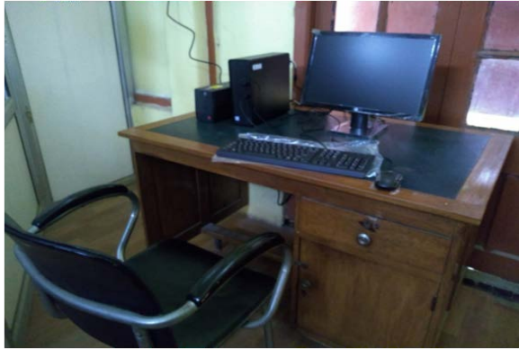
COMPUTER WITH ACCESSORIES