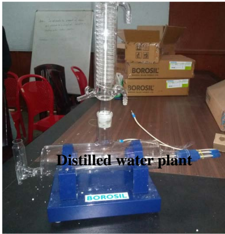
Distilled water plant