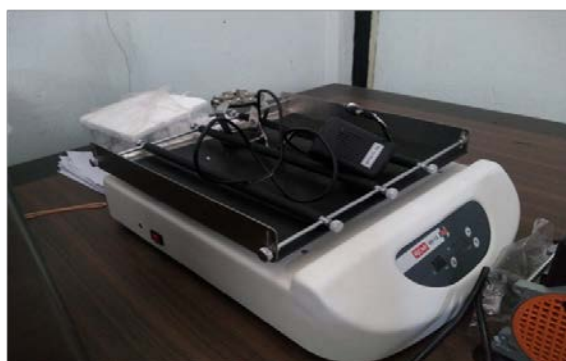
MINI ROTATORY SHAKER