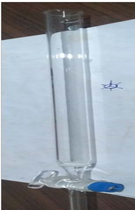
COLUMN CHROMATOGRAPHY COLUMNS