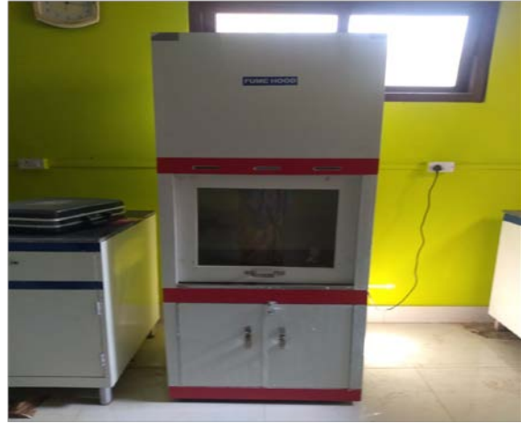
FUME HOOD CHAMBER