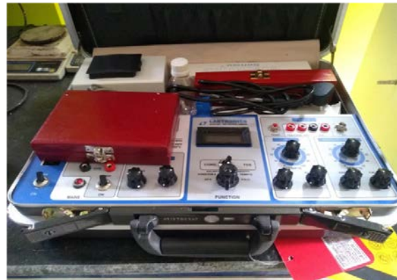
WATER ANALYSIS KIT