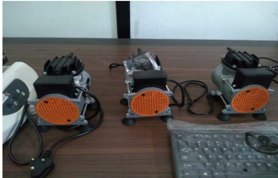
MOTORS FOR VACUUM PUMP