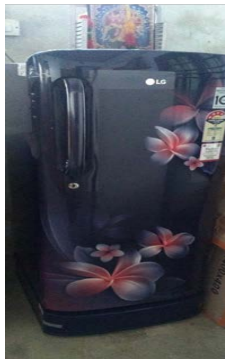
REFRIGERATOR FOR LABORATORY PURPOSE