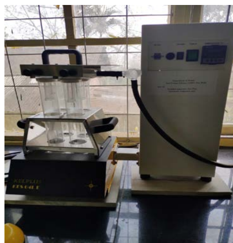
Kel Plus Kjeldhal apparatus