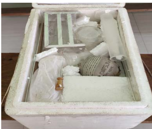
Quartz Double Distillation unit (7)