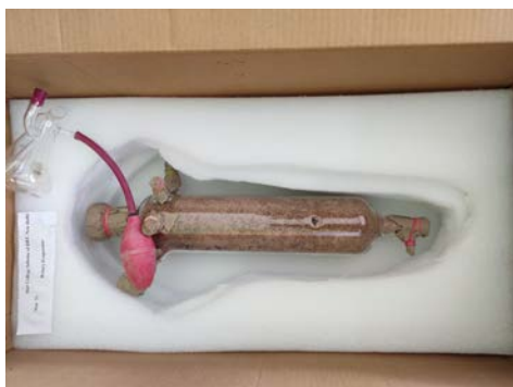
Rotary vacuum evaporator