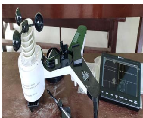
Automatic Weather Station